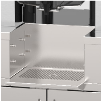
Removable drip tray