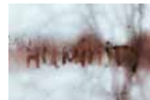
High Humidity Levels