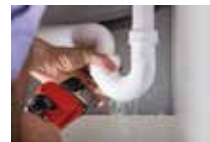
Burst Water Pipe