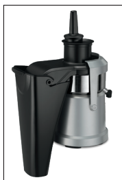
Optional Continuous Pulp Chute