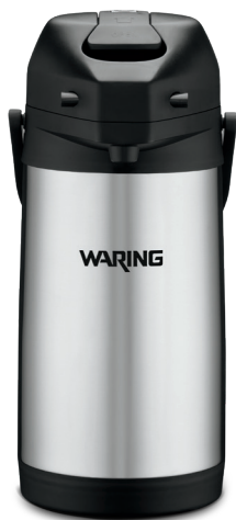
WCA25 2.5-Liter Stainless Steel Airpot