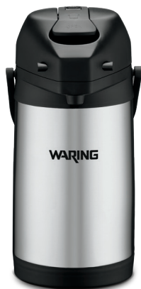
WCA22 2.2-Liter Stainless Steel Airpot