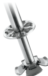
CAC123 Butterfly Agitator (6 pack)