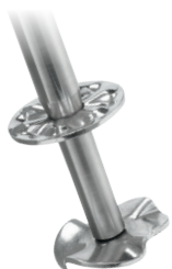
CAC112 Solid Agitator (6 pack)