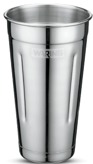
CAC20 Stainless Steel Malt Cup