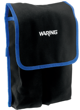
Storage/Transport Case Included