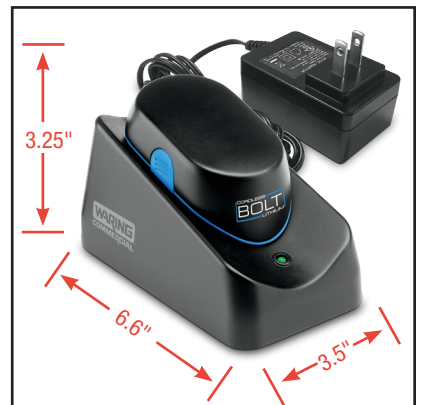
Battery Charging/Docking Station with 1.5-Hour Quick-Charging Circuit