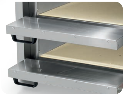
Refractory stone decks