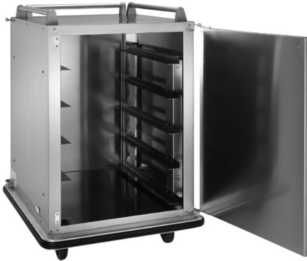
Model RS-10 shown with optional full perimeter bumper

Vulcan Hart Model RS-10 room service cart with capacity for ten 15" x 20" trays and 14" x 18" trays. Stainless steel construction throughout including top, sides, bottom, and doors with double pan base and reinforced internal channels. Non-marking corner bumpers protect both the cart and facility. Double pan door design is fully insulated providing 270 degree swing on 12 gauge hinges with recessed door pulls. Magnetic door closure and magnetic device to hold door open. 5" heavy duty casters, two swivel and two rigid ensure easy maneuverability. Universal one piece racking with five levels and 6" spacing between levels. Two 15" x 20" trays or 14" x 18" trays per level. Top rails for easy handling and transporting items on top of unit. One year limited parts and labor warranty. After the first year, lifetime parts warranty on the heating elements.