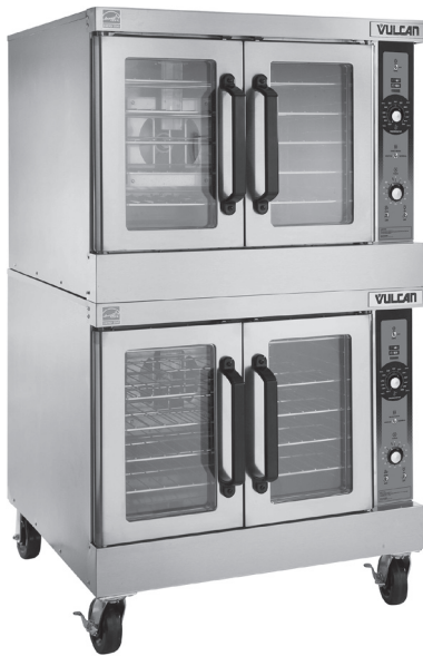
Model SG44 shown with optional casters