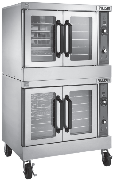
Model VC66GD shown with optional casters