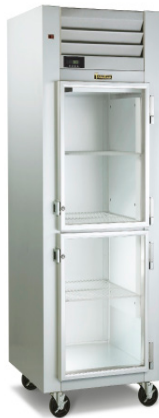
Model Shown One Section (shown with optional interior arrangements & casters)