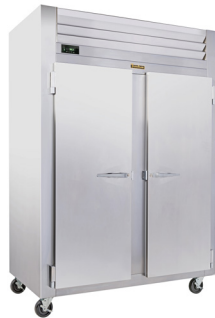
Model Shown Two Section