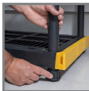
ADJUSTABLE LEVELING FEET