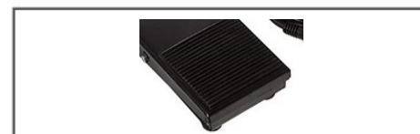
Pedal foot for handsless operation