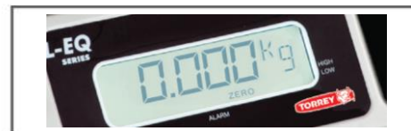
Easy weight visibility