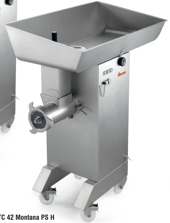
TC 42 Montana PS H