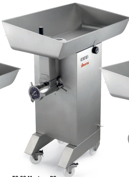
TC 32 Montana PS