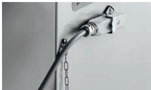
TC 32 - 42 Montana PS H Hamburger attachment