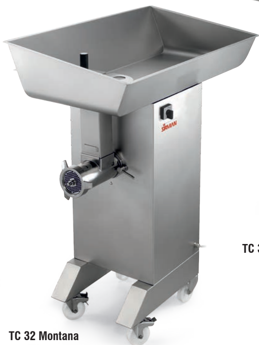
TC 32 Montana