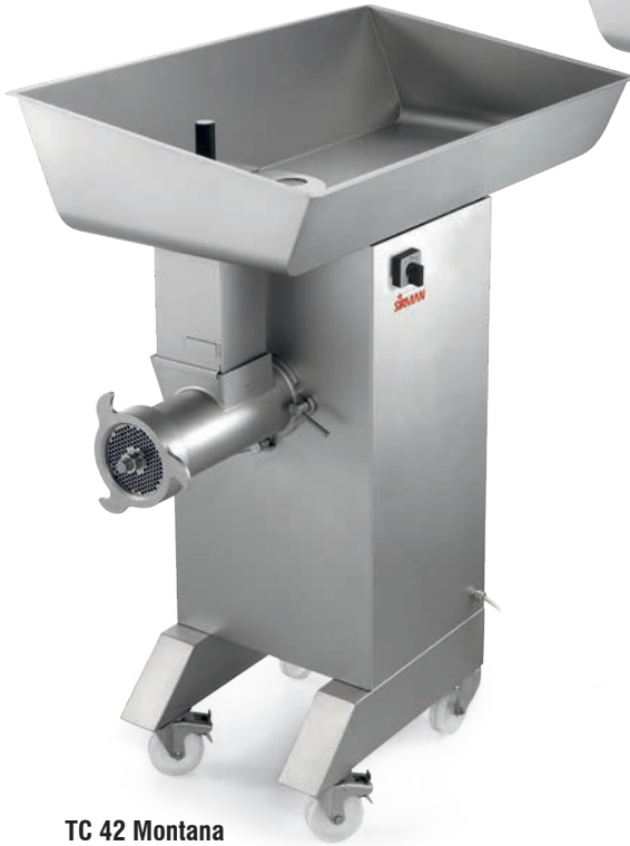
TC 42 Montana

Certified to UL Standard 763 and NSF Standard 08 Certified to CSA Standard C22.2