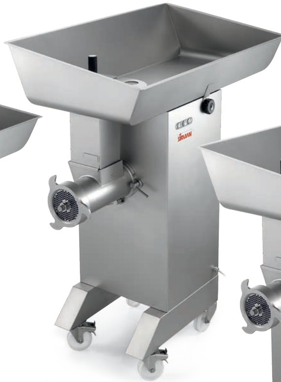
TC 42 Montana PS