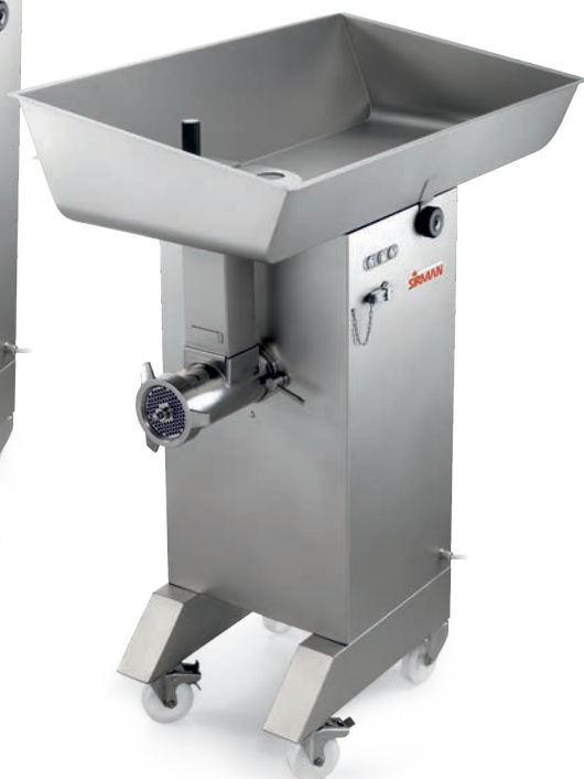
TC 32 Montana PS H