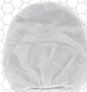
WC-9910 Toddy strainer

1 Toddy reusable coffee strainer 50 Toddy one-time use paper filters with string