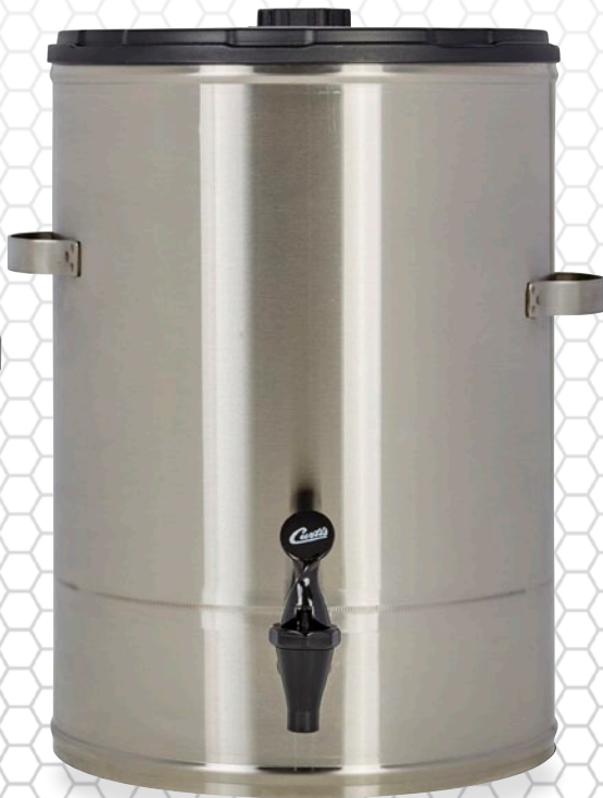
TC-7HK 7.0 Gallon Cold Brew Coffee System