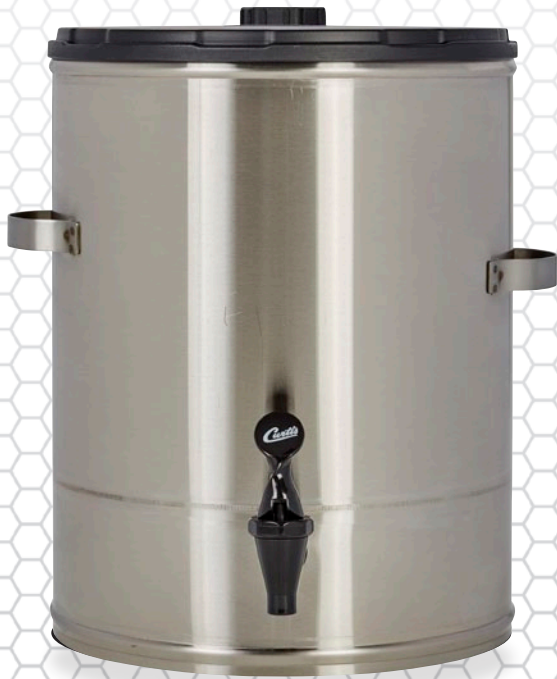
TC-6HK 6.0 Gallon Cold Brew Coffee System