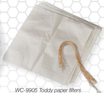
WC-9905 Toddy paper filters