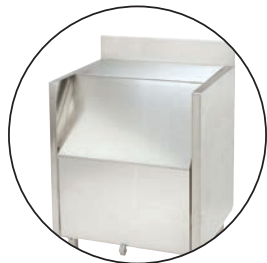
Optional Locking Cover Available - Includes Padlock & 2 Keys