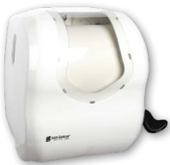
WHITE/CLEAR - CLEAN, CLASSIC, FRESH