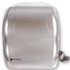
STAINLESS STEEL LOOK - HIGH END, VERSATILE, CLASSIC