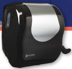
BLACK/STAINLESS LOOK - CLEAN, CONTEMPORARY, SLEEK