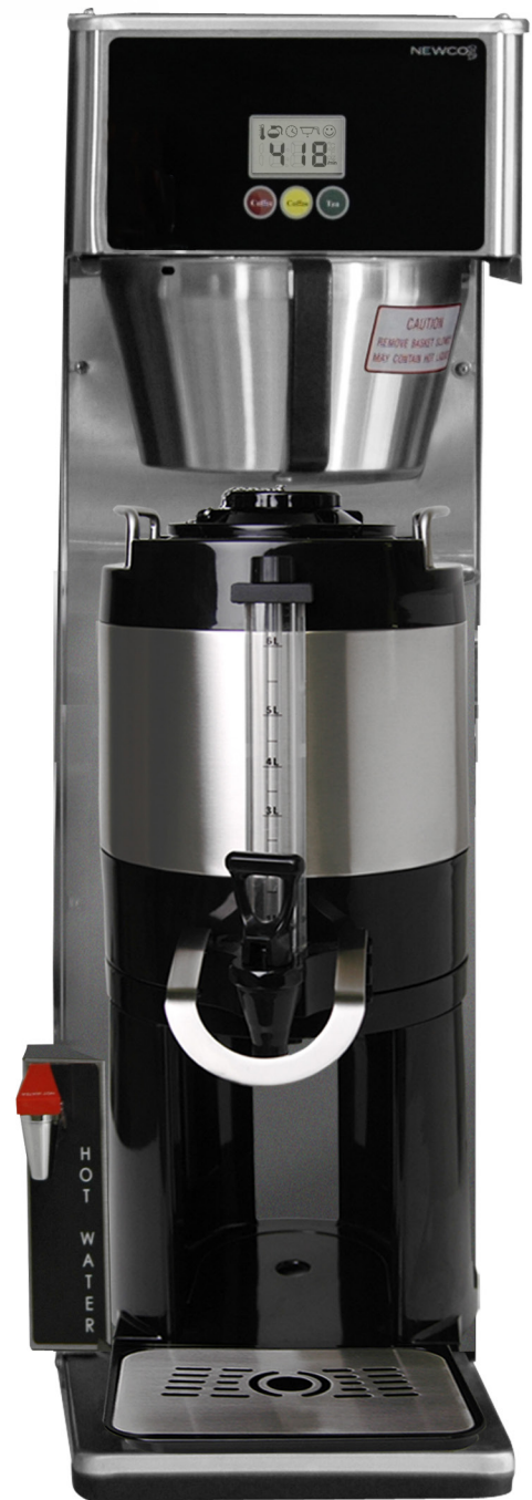
PN: 784820 STVT Tall Coffee shown with 1.5 Gallon Vaculator Thermal Server with Detachable base.