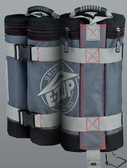
Deluxe Weight Bags