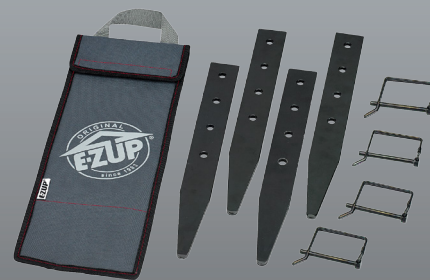
Heavy-Duty Stake Kit

International E-Z UP, Inc. 1900 Second Street Norco, California 92860 (951) 279-0999 • FAX (800) 810-8775