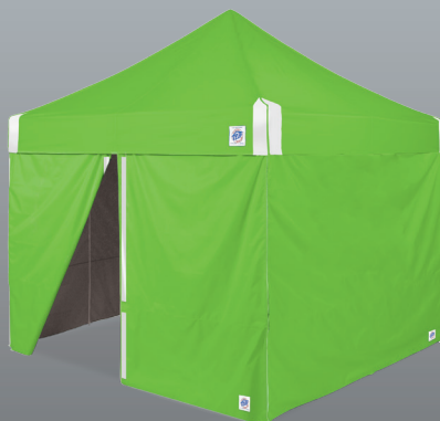
Matching Hi-Viz® Sidewalls