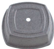
1111SQVS Fits 11" Syracuse Quadra Plate 1212SQVS Fits 12" Syracuse Quadra Plate