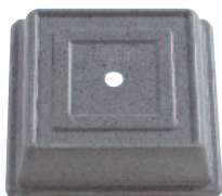
85SFVS Fits 8½" Oneida Sant' Andrea Fusion Plate 978SFVS Fits 9¾" Oneida Sant' Andrea Fusion Plate