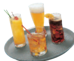
Camtread® Trays Non-skid surface ensures drinks & meals stay in place during transport.

5 5 Year Guarantee against delamination.