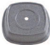
99SMVS Fits 9" Steelite Distinction Metro Plate 1111SMVS Fits 11" Steelite Distinction Metro Plate