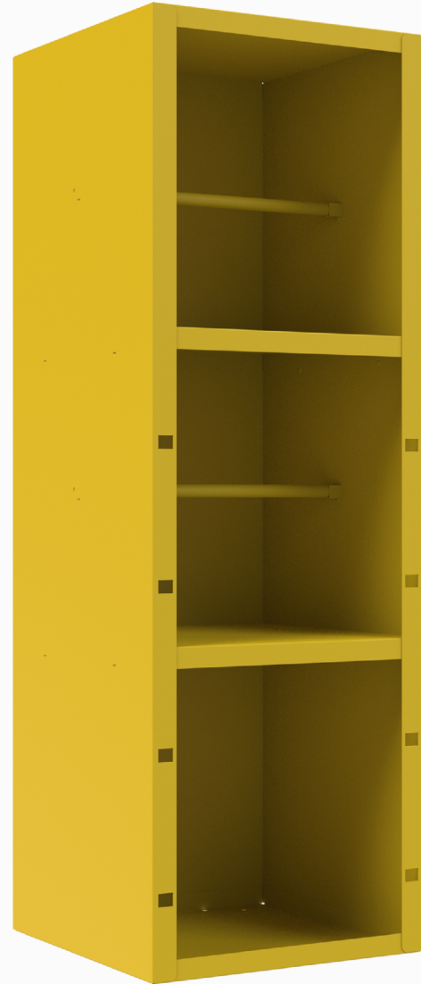
Shown without covers