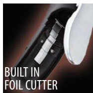
BUILT IN FOIL CUTTER