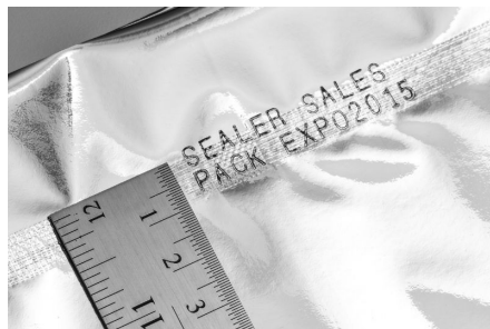
Dry Ink Coding Print at Seal Line