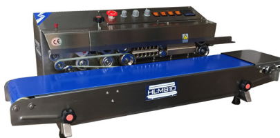
Option: Left to Right Feed Model No. HL-M810I_RtoL