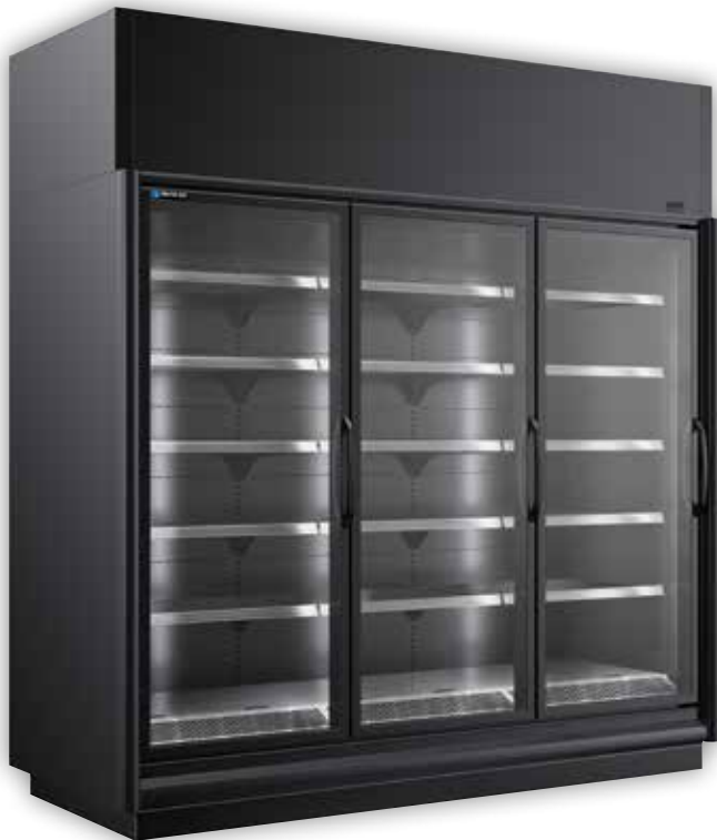
BEM-3-30SC/BEL-3-30SC (shown with ends installed and semi-self-contained refrigeration system)