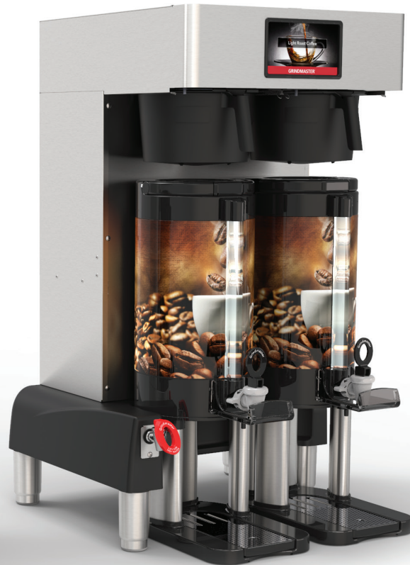
model PBC-2VS vacuum Shuttles and graphics sold separately