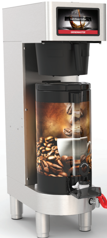
model PBC-1V vacuum Shuttles and graphics sold separately