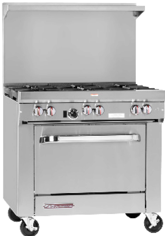
S36D (shown with optional casters)