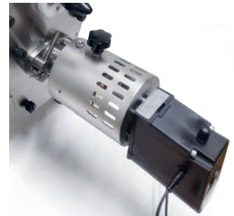
Pasta Cutter optional

The bowl is quickly disassembled and removed completely