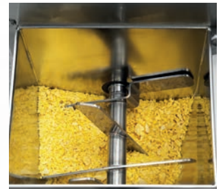
Mixing hopper designed to better knead pasta dough