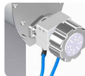
Frio 5: Optional head cooling kit