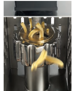
Pasta Cutter Accessory