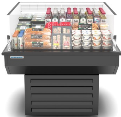
Full Visibility Plexiglass Optional

Self-Service Island Mobile 4-Sided Viewable / Accessible Display