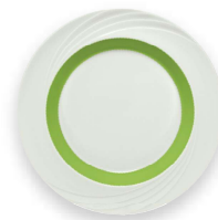
Light Green *