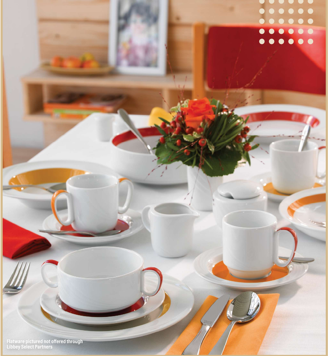
Flatware pictured not offered through Libbey Select Partners