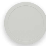
5" Grey Round Cover PBT ● No. 9444126-10113 H½" 1 doz. Fits 10 oz. Round Stackable Salad/ Fruit Dish