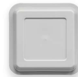
4¾" Grey Square Cover PP No. 9442124-70413 H¾" 1 doz. Fits 8½ oz. Square Stackable Salad/ Fruit Dish