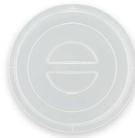
9" Semi-Translucent Plate Cover PP * No. 9441240-70411 H1½" 6 pcs. Fits 9" Comfort Bowl and 9" Special Deep Rim Bowl