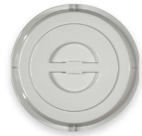
9" Grey Plate Cover PBT * No. 9441237-10113 H1½" 6 pcs. Fits 9" Comfort Bowl and 9" Special Deep Rim Bowl