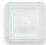
4¾" Semi-Translucent Square Cover PP No. 9442124-70411 H1½" 1 doz. Fits 8½ oz. Square Stackable Salad/ Fruit Dish