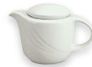
12 oz. Teapot No. 9184335 12 oz./355 ml. H4¼" D3¾" 6 pcs.