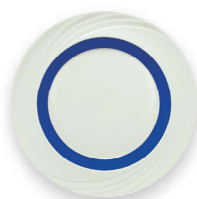
Dark Blue *