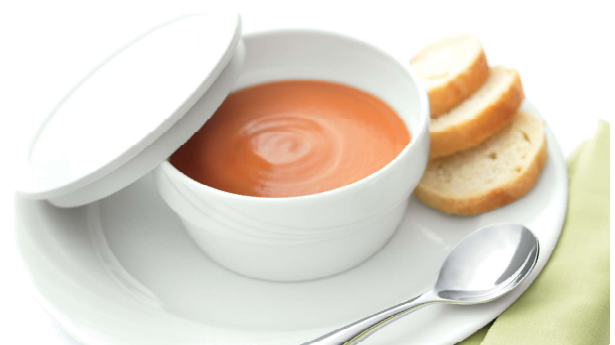
10¼" Grey Plate Cover PBT No. 9441270-10113 H1½" 6 pcs. Fits 10¼" Special Rim Plate and 10" Three Section Plate

Donna Senior covers are designed to help food retain its temperature; they are not intended for protecting or sealing contents during transport.