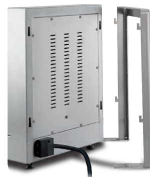
Wall mount kit, optional