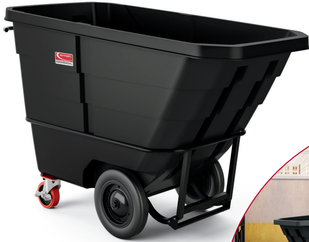
RMTTHD100 model shown