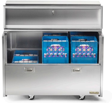
Model Shown - RMC49D4