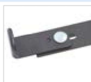
MATTRESS RETAINER CLIPS ARE EASY TO ADJUST