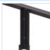
FEET ADD EXTRA SUPPORT