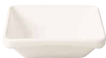
SKSTD11 7 oz 4 1/8" L 4 1/8" W 12