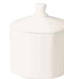
SKSU25 8 7/8 oz 3 1/8" D 4 1/2" H 6 Replacement Lid SKSU25LD 12