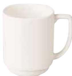
SKSM30 10 1/2 oz 3" D 3 3/4" H 12