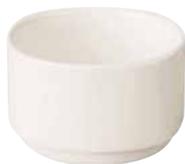
SKCU17M5 5 3/4 oz 3 1/2" D 2 1/8" H 12