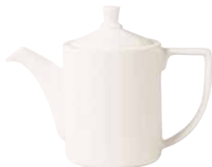
SKCP70 23 3/8 oz 4" D 6 3/8" H 4 SKCP35 11 1/2 oz 3 1/8" D 5 1/8" H 4 Replacement Lid for SKCP70 SKCPLD2 12 Replacement Lid for SKCP35 SKCPLD1 12