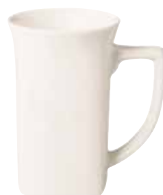
SKMG33 11 1/2 oz 3 1/8" D 12 SKMG22 7 7/8 oz 2 3/4" D 6