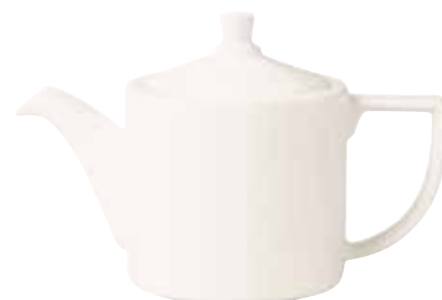
SKTP80 27 oz 4 3/8" D 6" H 4 SKTP40 13 5/8 oz 4" D 4 5/8" H 4 Replacement Lid for SKTP80 SKTPLD2 12 Replacement Lid for SKTP40 SKTPLD1 12