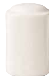
SKSS01 1 1/2" D 3 1/2" H 6