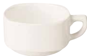
SKCU30 10 1/2 oz 4" D 12 SKCU23 7 7/8 oz 3 5/8" D 12 SKCU17 5 3/4 oz 3 1/2" D 12 SKCU09 3 oz 2 1/8" D 12