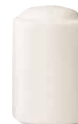
SKPS01 1 1/2" D 3 1/2" H 6