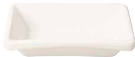
SKRTD15 7 7/8 oz 6" L 4" W 12