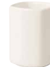
SKTH01 2 oz 1 1/2" D 2 1/8" H 6