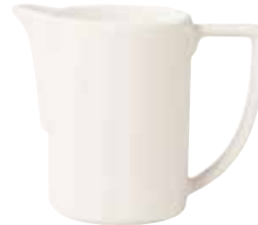
SKCR15 5 oz 2 1/8" L 3 5/8" H 6 103JG02* 2/3 oz 1 1/8" L 1 7/8" H 6 *Without handle