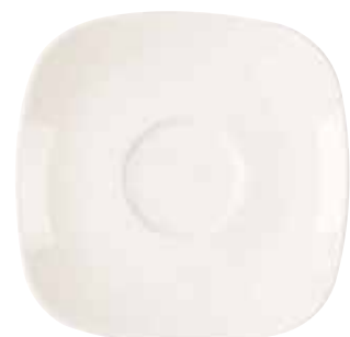
SKSA16* 6 7/8" L 6 7/8" W 12 SKSA14** 5 1/2" L 5 1/2" W 12 SKSA12*** 4 5/8" L 4 5/8" W 12 *Compatible with SKC30/ SKCS30 ** Compatible with SKCU23 / SKCU17 / SKCU17M ***Compatible with SKCU09