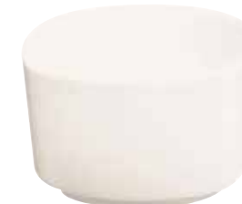
SKSH23 7 7/8 oz 3 1/2" D 2 1/8" H 12