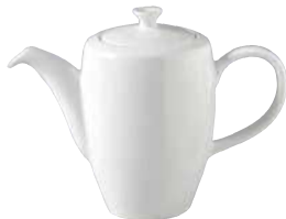
CLCP35 11 1/2 oz 3 1/2" L 4 Replacement Lid CLCPLD1 12