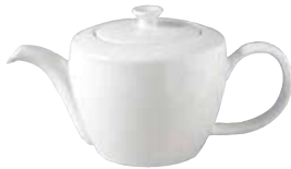
CLTP40 13 3/4 oz 4 1/4" L 4 Replacement Lid CLTP40LD 12