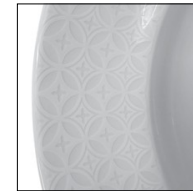
182 - Lace