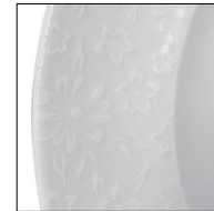
183 - Blossom