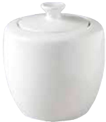
CLSU27 9 1/2 oz 3 1/2" D 6