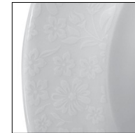
184 - Bouquet