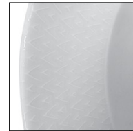
185 - Favourite