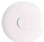
CLSA13 5" D 12 Compatible with CLCU09 /CLSC09