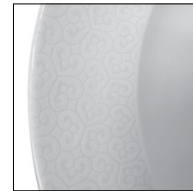
180 - Choice