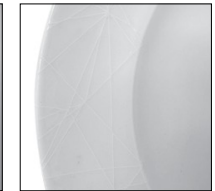
181 - Wonder