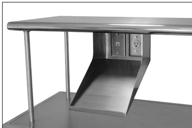
FACTORY INSTALLED ONLY