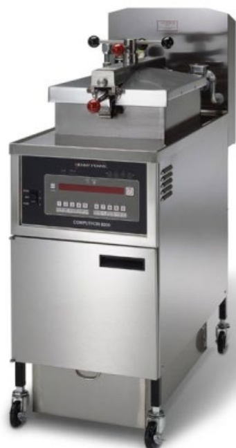
PFG 600 gas pressure fryer with Computron™ 8000 control

Henny Penny first introduced commercial pressure frying to the foodservice industry more than 50 years ago. Frying under pressure enables lower cooking temperatures for longer oil life, and faster cooking times to meet peak demand. Pressure also seals in food's natural juices and reduces the amount of oil absorbed into product.