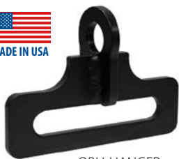
OBH-HANGER OBH Hanger