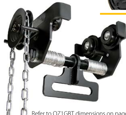
OZGBT-OBH Geared Trolley with OBH Hanger