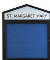
UV1306TB with UV1309