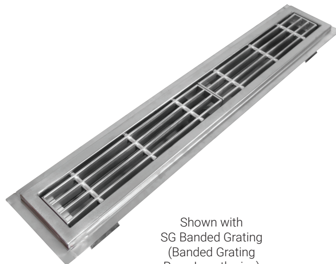
Shown with SG Banded Grating (Banded Grating Runs Lengthwise)