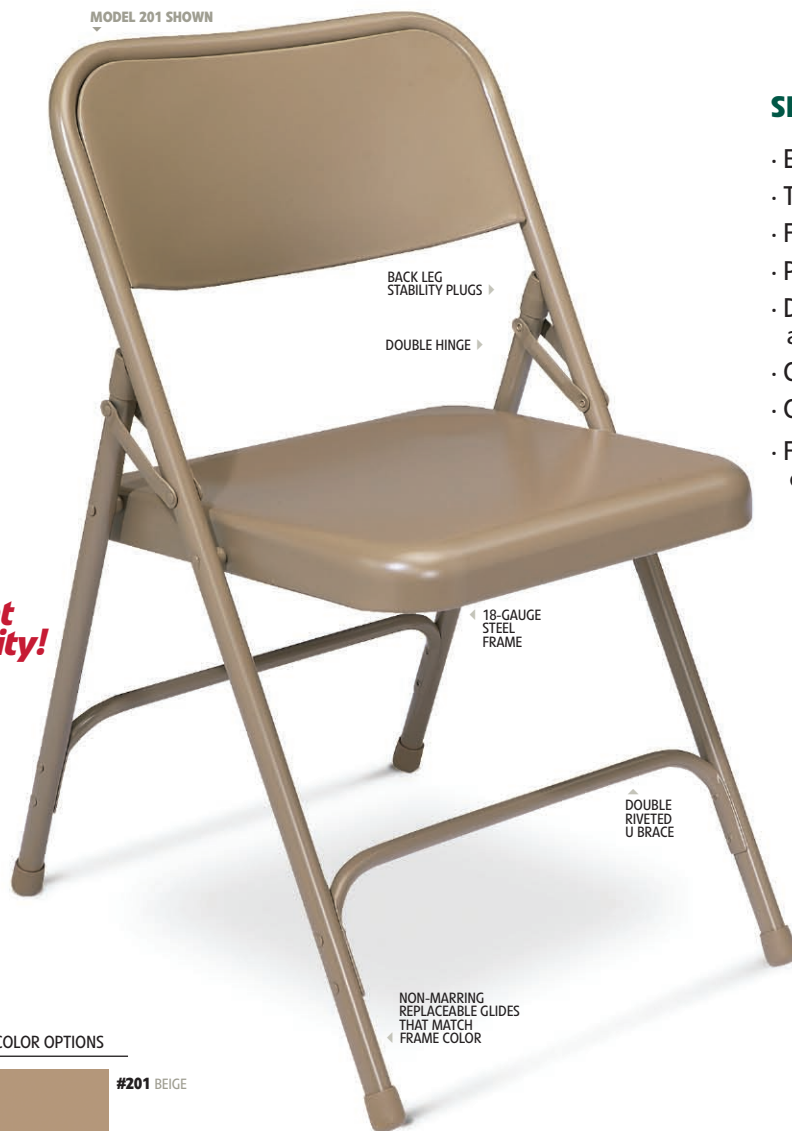
MODEL 201 SHOWN