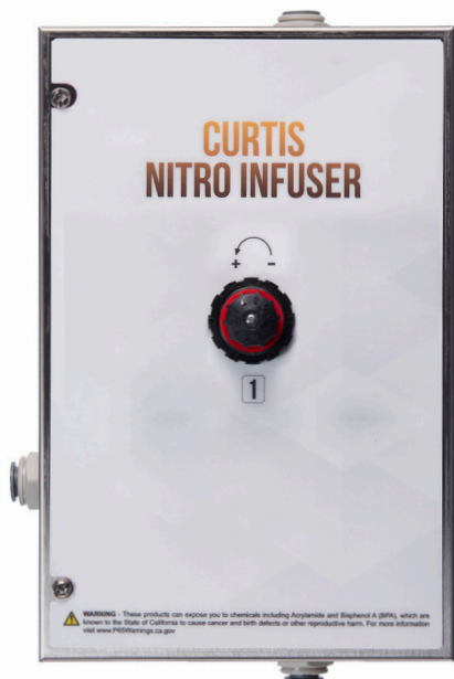
NIB1 Nitro Infuser Box 1 Head