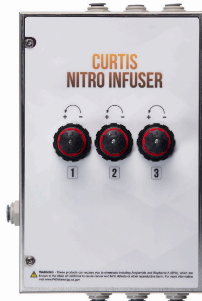
NIB3 Nitro Infuser Box 3 Heads