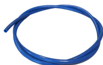
WC-53118-120K 10 ft. Tubing