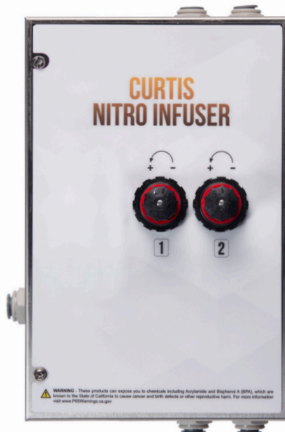
NIB2 Nitro Infuser Box 2 Heads