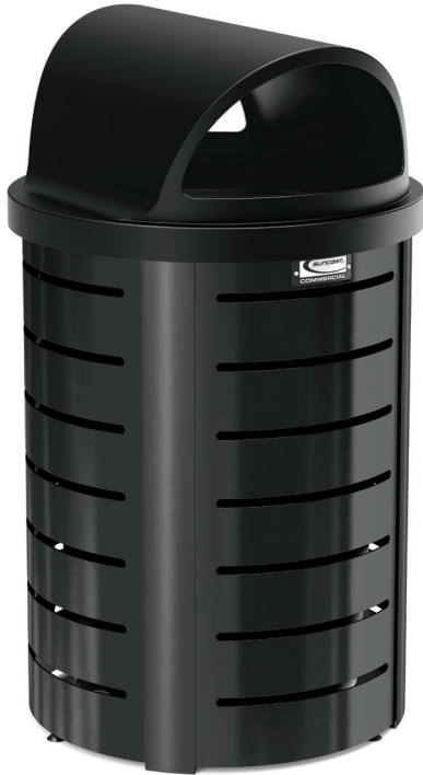
MTCRND3501 model shown