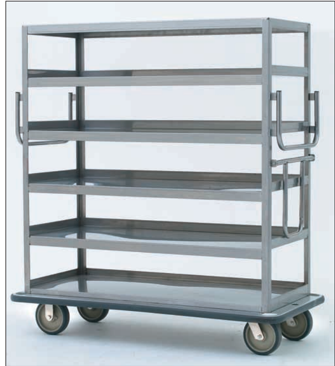
MQ-609L (Shown with optional swing-up handle)