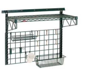
Task Station (medium duty) with accessories for a sink/prep area.