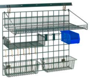
Task Station (standard duty) with accessories for a food prep area.