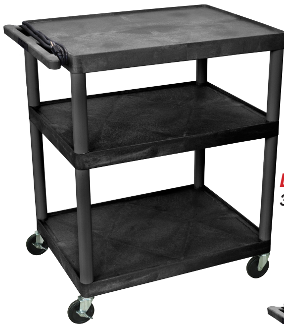
LP40E-B 32"W x 24"D x 40 1 / 4 "H