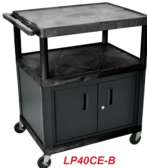
LP40CE-B 32"W x 24"D x 40 1 / 4 "H