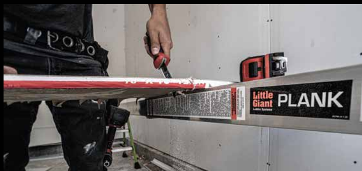
Doubles as a Work Surface