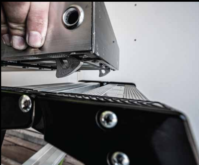
Integrated Rung Locks