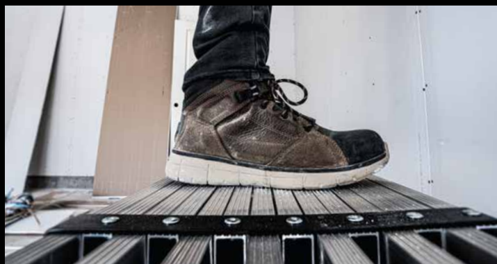
Slip-Resistant, Wide-Tread Platform