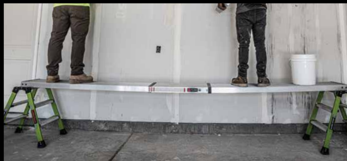
Two-Person, 500 lbs Rated