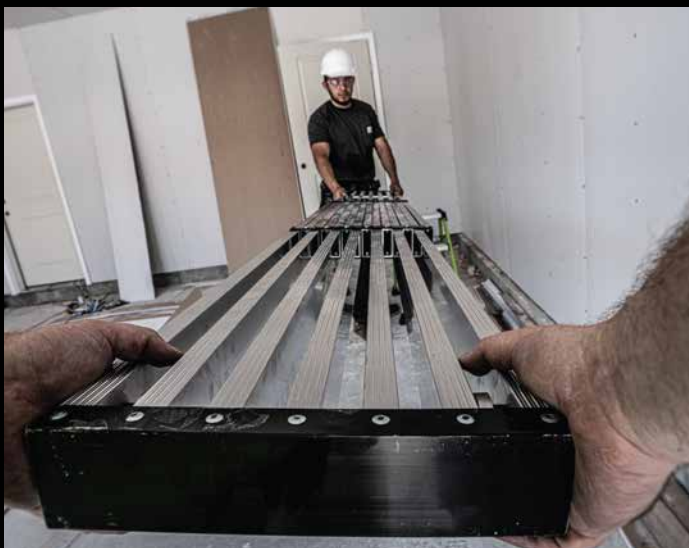
Telescopes Out for a Larger Workspace