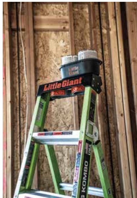
Multiple Attachment Methods