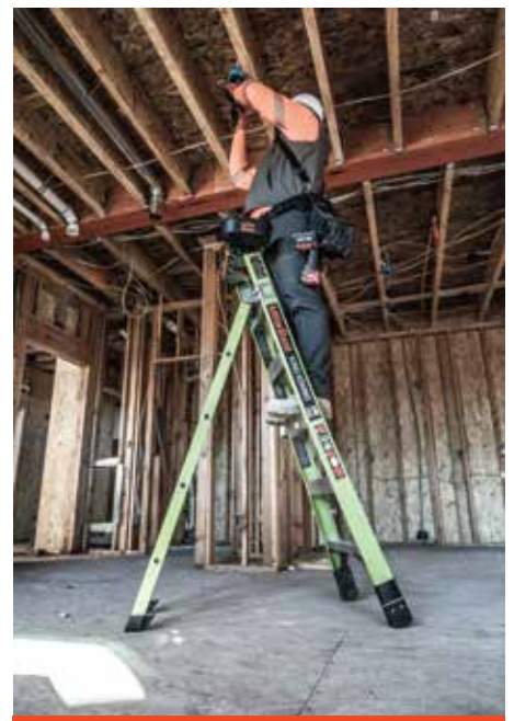
Keep Loot Close