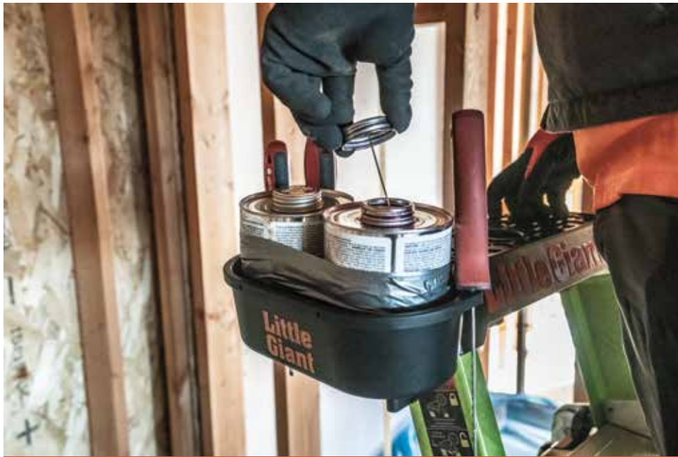
Can, Primer and Cement Compartment