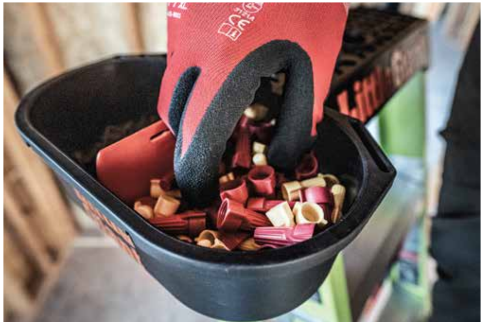
Removable Partition to Separate Fasteners, Nuts and Bolts.