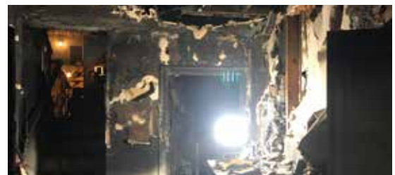
LE360LED-FS Durable metal floor stand