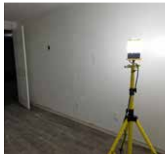
LE360LED-TR Heavy duty 4-8' adjustable tripod