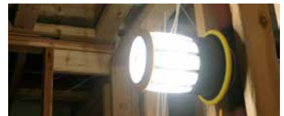
LE360LED-MAG Heavy duty single magnet