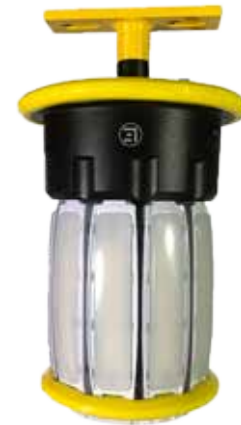
LE360LED Light head and yoke

What makes the Blaze unique is its versatility. Use it as task lighting on a tripod to illuminate an entire room. Clamp it to scaffolding on skyscrapers. Place it on a metal beam in an attic. Even daisy-chain it as part of the LED Jobsite System for large area lighting. Whatever your project lighting needs are, the Beacon360 Blaze will meet it.